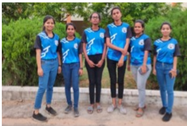
Chess Women team participated at VTU Rest of Bengaluru zone Chess tournament held at SJMIT, Chitradurga during 22nd & 23rd June 2022. Secured 5th place.