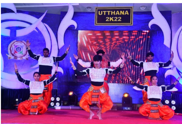
Inauguration of Malenadu Mela-2022 by the dignitaries