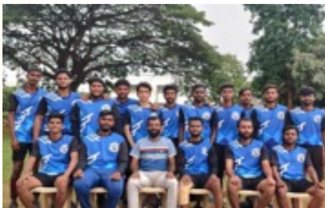
Handball Men team participated at VTU Central Karnataka zone Handball tournament held at AIT, Chikkamagaluru during 22nd & 23rd June 2022. Secured Third place.