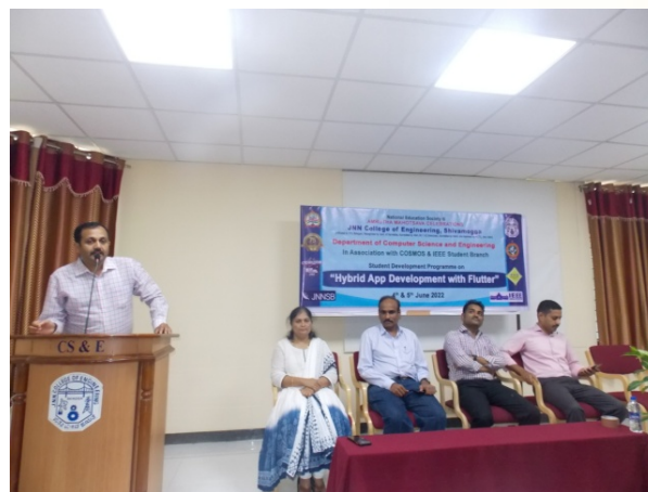
SDP on "Mobile Application Development with Kotlin" during 14/05/2022 to 16/05/2022.