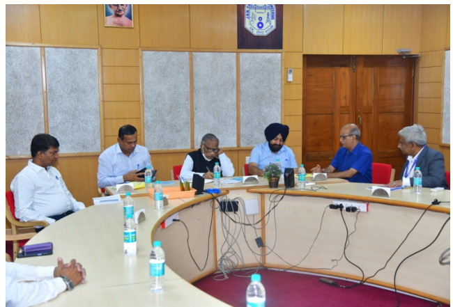
Presentation during NBA Compliance visit on 09/07/2022