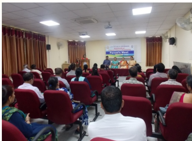
Parents Meet on 27/08/2022.