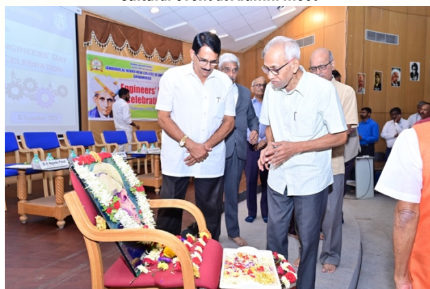
Engineers Day Celebration