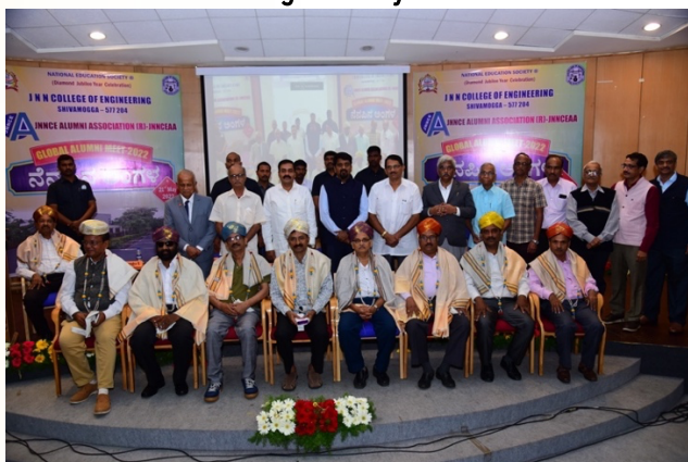
Felicitation to Alumni