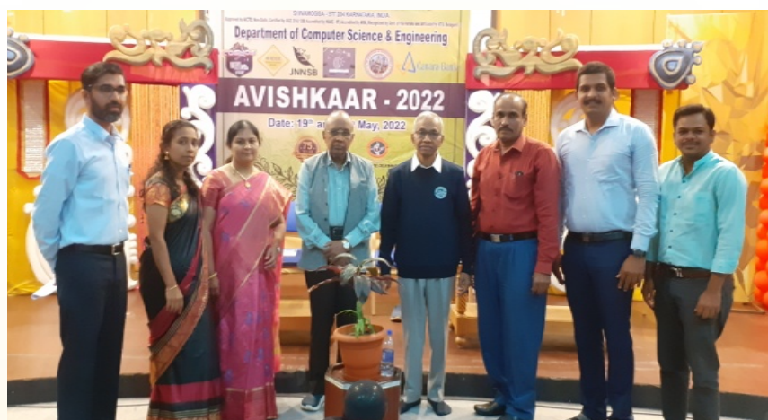
AVISHKAAR-22, under IEEE during 19-05-2022 to 20/05/2022.