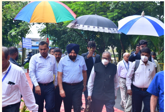
NBA Compliance Visit – 09/07/2022