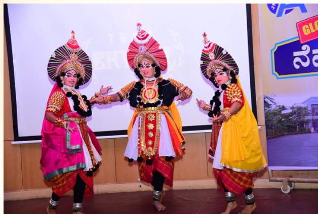
Cultural event at Alumni meet