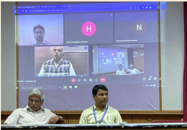
KSTA sponsored workshop on "Hydro-Geological Engineering" from 22/08/2022 to 26/08/2022.