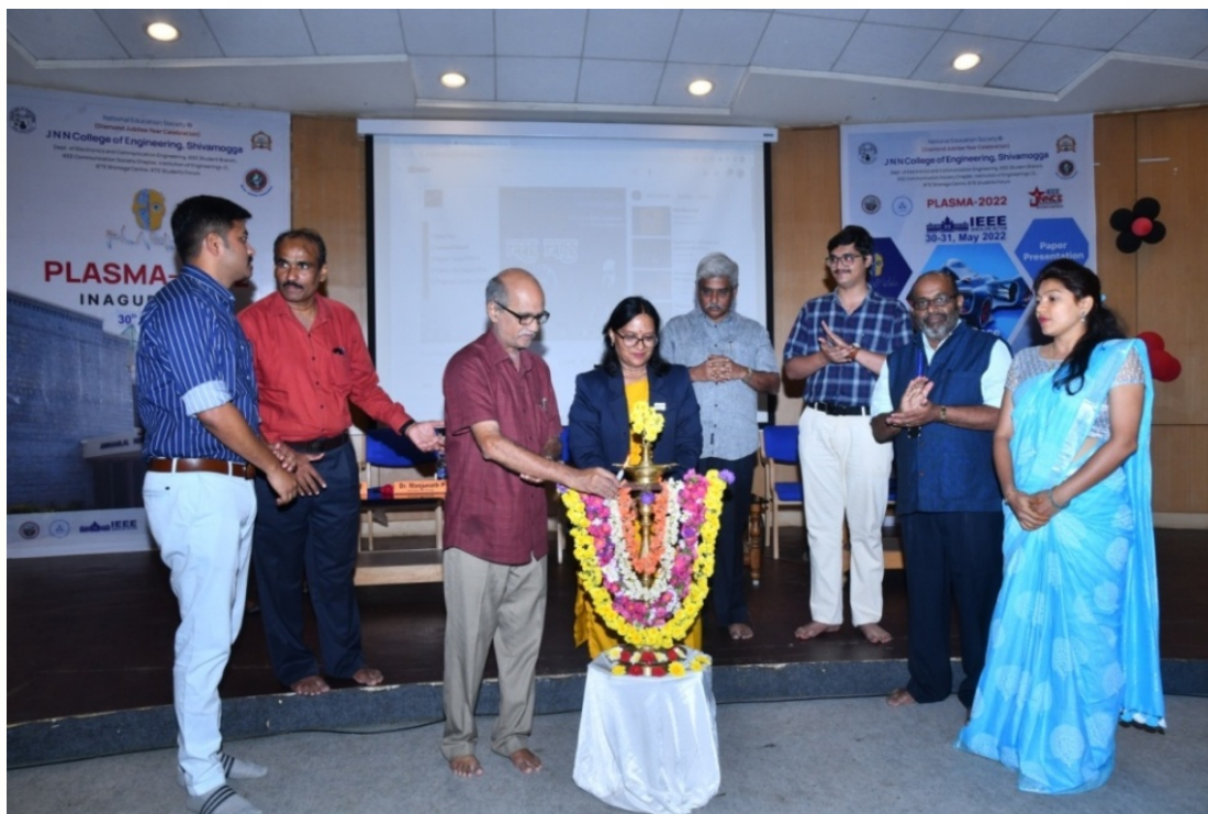
Inauguration of PLASMA-2022