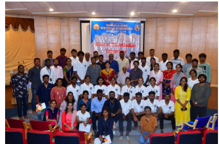
JANVEY Sports Day, first year inter section sports meet, PG Sports meet & Staff Sports meet prize distribution function was organized on 2 nd July 2022