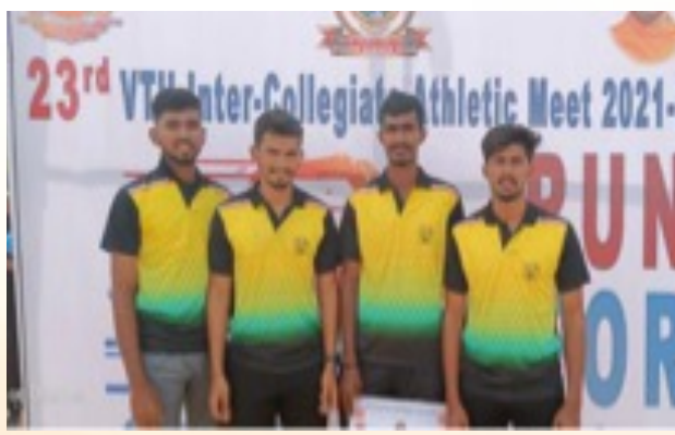
Athletic Men & Women team participated at VTU Single zone Athletic Meet held at SJBIT, Chikkaballapura, 27th to 30th Jun 2022.