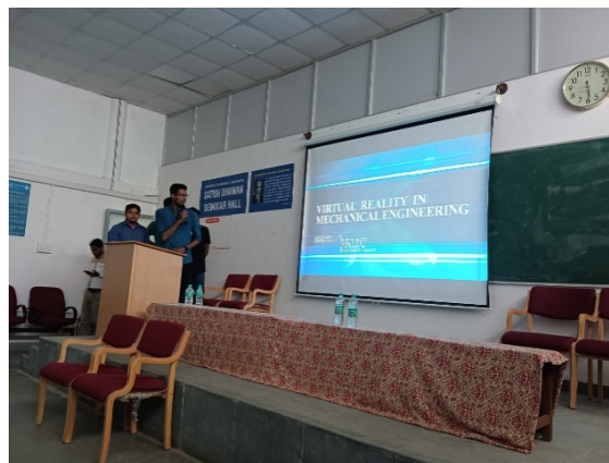
Technical paper presentation by students at MEA competition