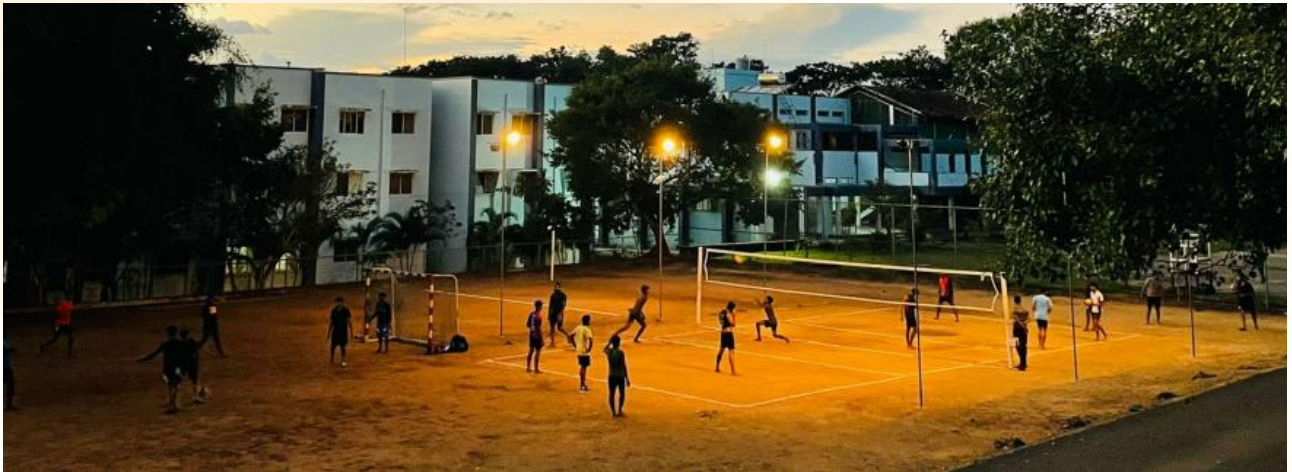
First year inter section sports meet 2022 was organized during 1 st April to 30 th April 2022 & First year PG Sports Meet 2022 was organized during 4 th Mat to 7 th May 2022