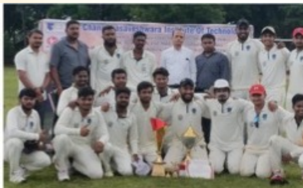
Cricket Men team participated at VTU Central Karnataka zone Cricket tournament held at CIT, Gubbi during 18th & 20th June 2022. Secured First place.