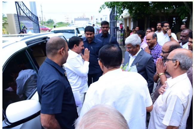
Welcoming Honorable Chief Guest of the Global Alumni Meet Sri Kakani Govardhan Reddy