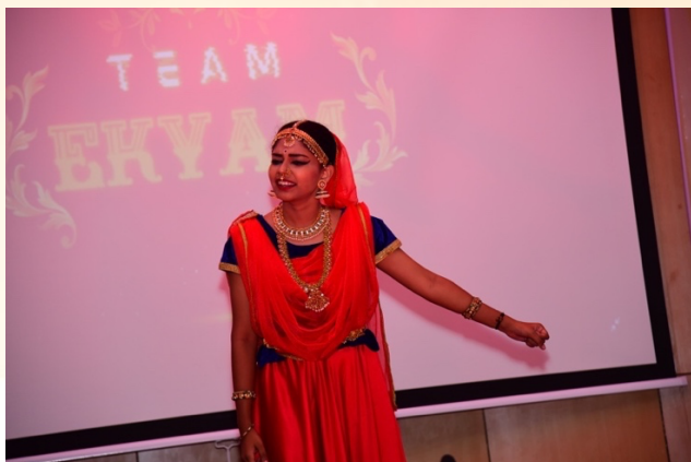
Alumni Meet Cultural event