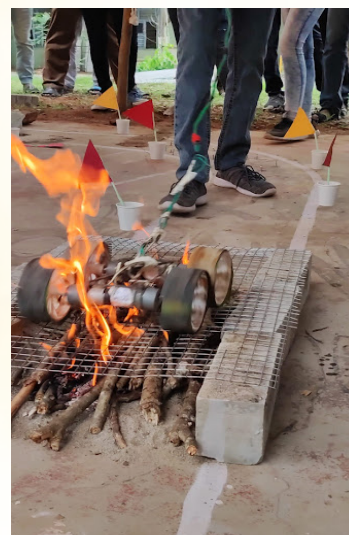
Blazin Wheel (Robo-Race and Robo – Soccer) event