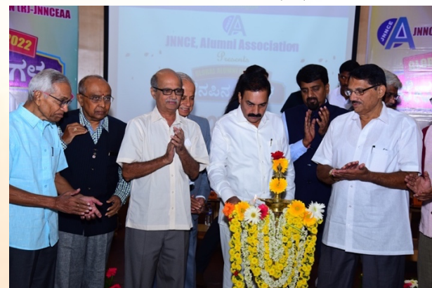
Inauguration of Global Alumni Meet - 21/05/2022