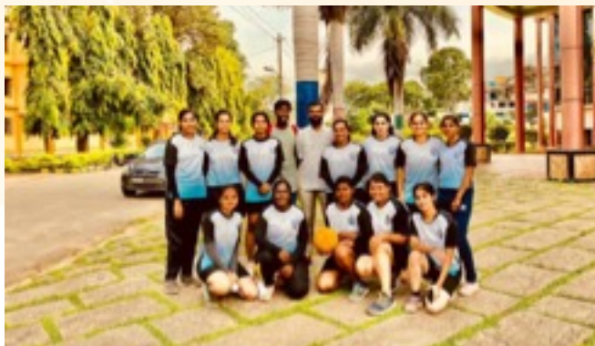
Throw ball Women team participated at VTU Central Karnataka zone Throw ball tournament held at KIT, Tiptur, during 7th & 8th June 2022. Secured Third place.