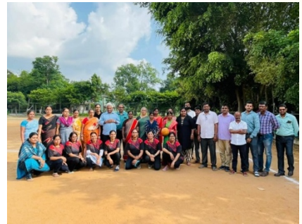
Staff Sports meet 2022 was organized during 11 th May to 27 th May 2022